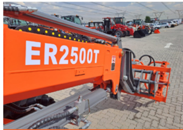
Sturdy telescopic arm