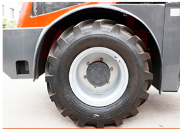
High shear forces from planetary axle