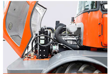
Easy-to-open engine hood