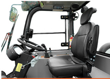
Comfortable cabin and good visibility