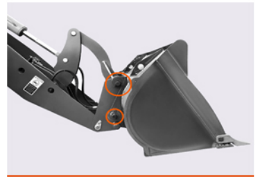
Quick and easy tool change