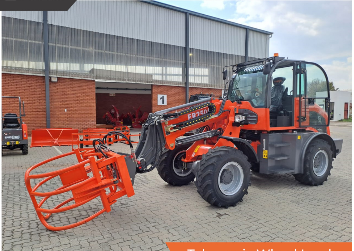
Telescopic Wheel Loader