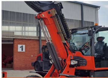
Two stronger lift cylinder