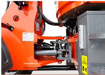
Everun articulated oscillating floating joint