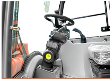
Adjustable steering column